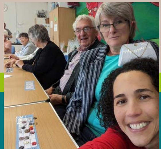
Friendship club at Zion Miner CC

And £240 was received in donations and raffle ticket money which has been sent directly to MS Trust for which we have received a letter of thanks.