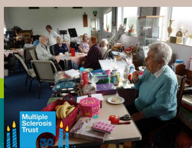
Garden Party at Stambourne CC