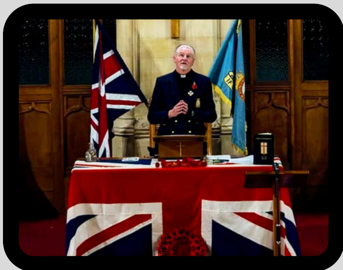
Clarendon Park Congregational Church Remembrance Service at Clarendon Park Congregational Church, at which RAFAC 1F Squadron were present.